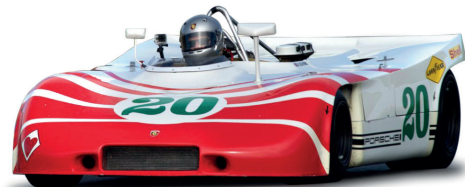
Porsche 908/3 Targa Florio 1970 #20