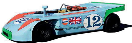
Porsche 908/3 Targa Florio 1970 Winner #12