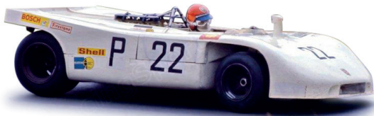
Porsche 908/3 1000 km Nurburgring 1970 Winner #22