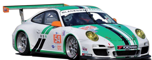
Porsche 997 Grand Prix Mosport 2011 #54