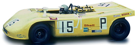
Porsche 908/3 1000 km Nurburgring 1970 #15